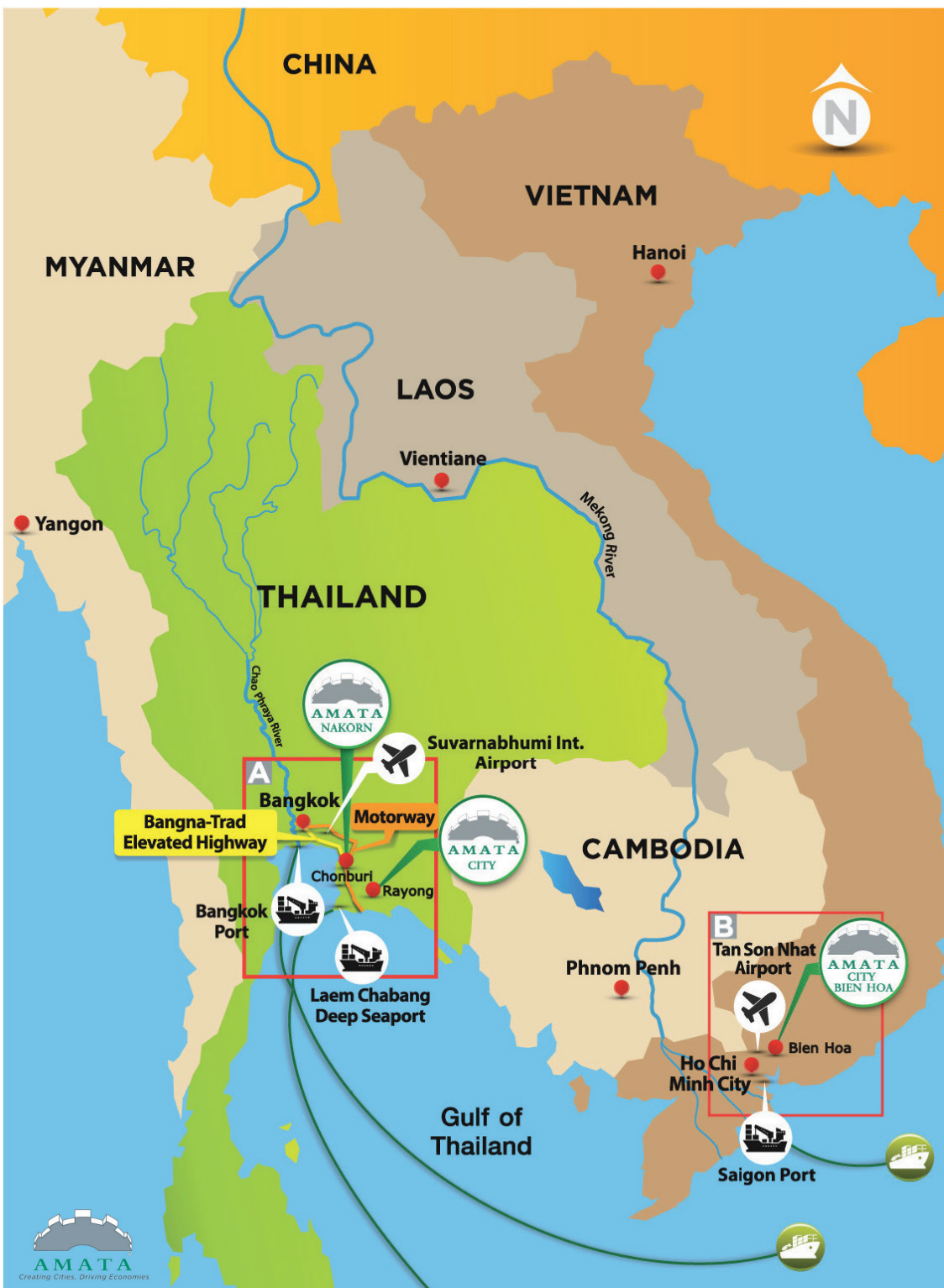
Amata's Strategic Location