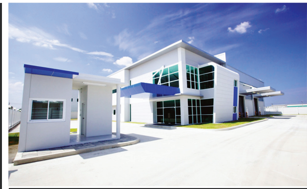
Ready Built Factory

Aesthetic & functional factories complete with finished office space, utilities, landscaping and many services. Extra efforts were given to unique design and multi-function. Each unit provides a sheltered loading area, a fenced compound, a driver way, security guard box and car parking space. The floor area range from 850 to 5,000 sqm. with possibility to expand.