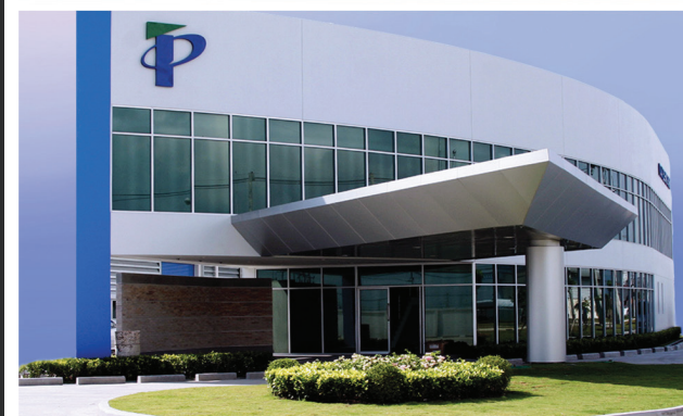
OTA Techno Park